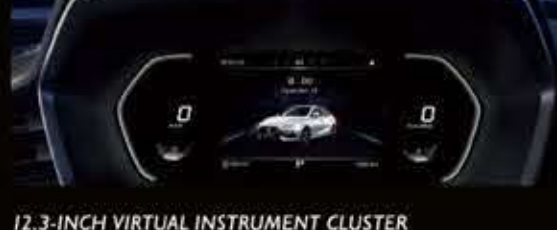
12.3-INCH VIRTUAL INSTRUMENT CLUSTER

Snaazzy interior with an ergonomic fighter jet-inspired cockpit, here's where comfort meets style. The New MG GT feels how it looks – polished and cozy. The driver-oriented dashboard is designed to bring better control and convenience when you pilot this sporty sedan. A pleasurable drive is at your fingertips with the MG GT's plush leather-wrapped steering wheel with paddle shifters and mounted multi-function controls.