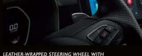
LEATHER-WRAPPED STEERING WHEEL WITH PADDLE SHIFTERS AND MULTI-FUNCTION CONTROLS