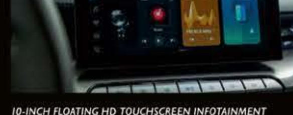
10-INCH FLOATING HD TOUCHSCREEN INFOTAINMENT SYSTEM WITH APPLE CARPLAY AND ANDROID AUTO