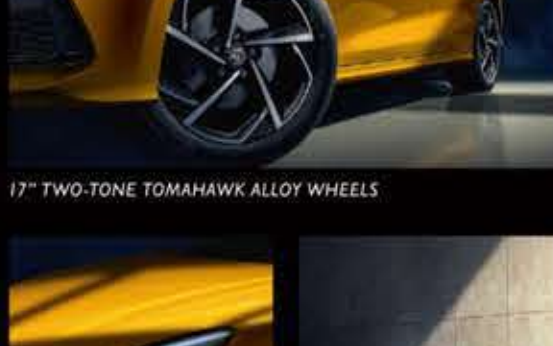
17" TWO-TONE TOMAHAWK ALLOY WHEELS