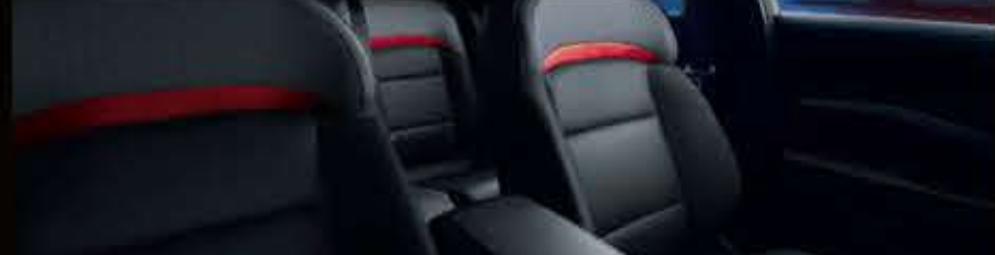
POWER ADJUSTABLE ZERO-GRAVITY SPORTS SEATS

What's a capable sports sedan without the advanced safety technology? The New MG GT hosts a wide array of active and passive safety driver assistance systems to make every spirited drive smooth and worry-free.