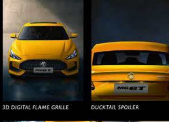
3D DIGITAL FLAME GRILLE DUCKTAIL SPOILER