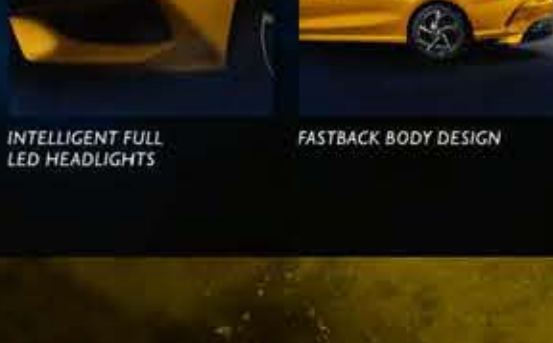
INTELLIGENT FULL LED HEADLIGHTS FASTBACK BODY DESIGN