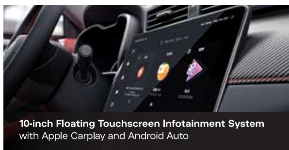
10-inch Floating Touchscreen Infotainment System with Apple Carplay and Android Auto