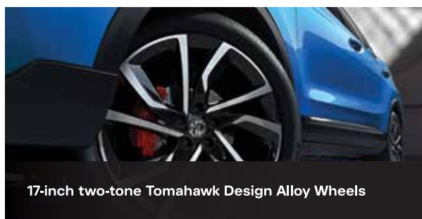
17-inch two-tone Tomahawk Design Alloy Wheels