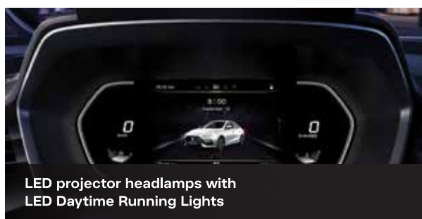
LED projector headlamps with LED Daytime Running Lights