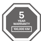
VEHICLE WARRANTY 5 YEARS/100,000 KM