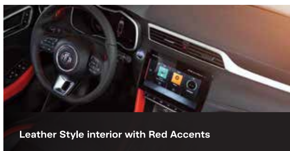
Leather Style interior with Red Accents