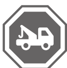
24/7 ROADSIDE ASSISTANCE