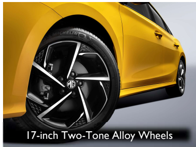
17-inch Two-Tone Alloy Wheels