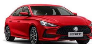
Extreme Speed Red