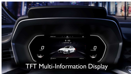
TFT Multi-Information Display