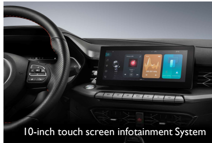
10-inch touch screen infotainment System