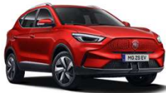
Extreme Speed Red