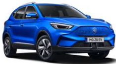
St. Moritz Blue